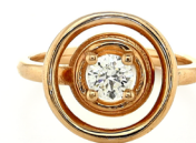
ROSE GOLD DIAMOND MINE RING