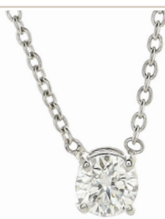
WHITE GOLD NECKLACE