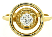
YELLOW GOLD DIAMOND MINE RING