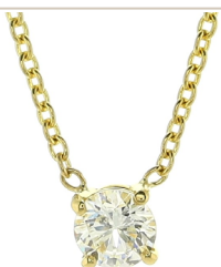
YELLOW GOLD NECKLACE