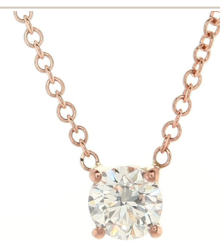
ROSE GOLD NECKLACE