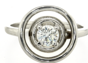
WHITE GOLD DIAMOND MINE RING